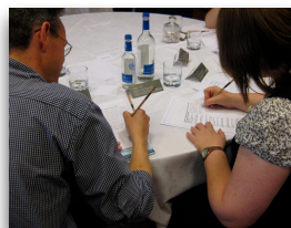
Two teachers provide examples of how their students do things differently

For the research team this was a valuable opportunity to collect data which strongly reflects the voice of the teacher. More details are available on the RECME microsite on the portal.