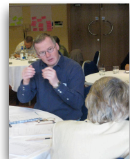
Deep in discussion