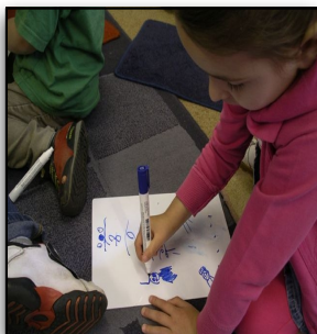
Here are some number like marks made by a child after they had been singing a counting back number rhyme with their teacher.

For the RECME Project the initiative focuses on three aspects: A collaborative Children's Mathematics network group Mathematics CPD at a Children's Centre A group of teachers involved in Early Years mathematics research project (also professional development) at the same centre.